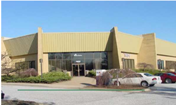
Where We're Going-7484 Candlewood