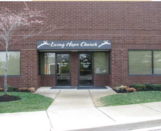
Where We Are-508 McCormick