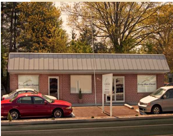
Where We Started-911 Reece Road